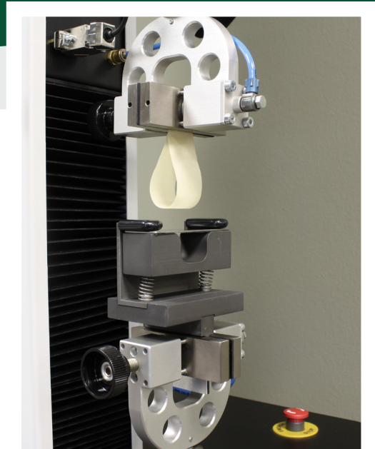
Loop Tack Fixture (TA-LTF-100) Shown with TA94 Grips